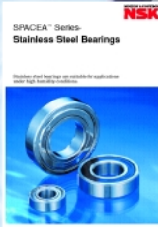
CAT. No. E1231