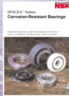
CAT. No. E1228