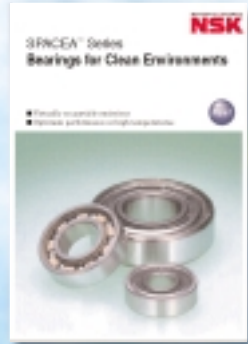
CAT. No. E1229