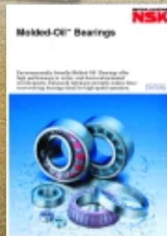
CAT. No. E1216