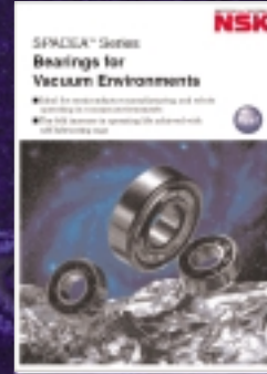
CAT. No. E1227