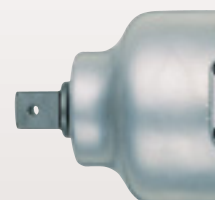
No.GT-S45R-1.5 (Short Anvil)